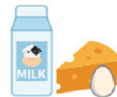
Milk & Cheeses Eggs