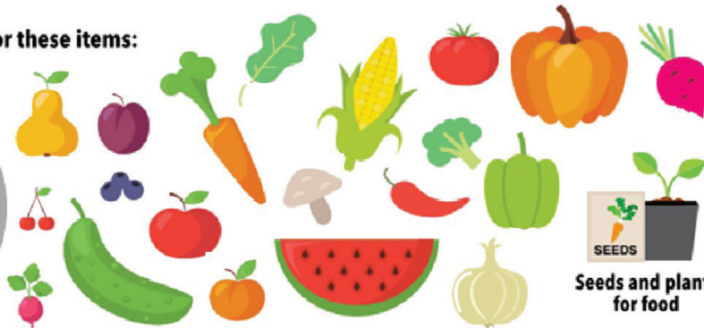
Seeds and plants for food

Michigan Grown Fresh Fruits and Vegetables