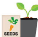
Seeds and plants for food